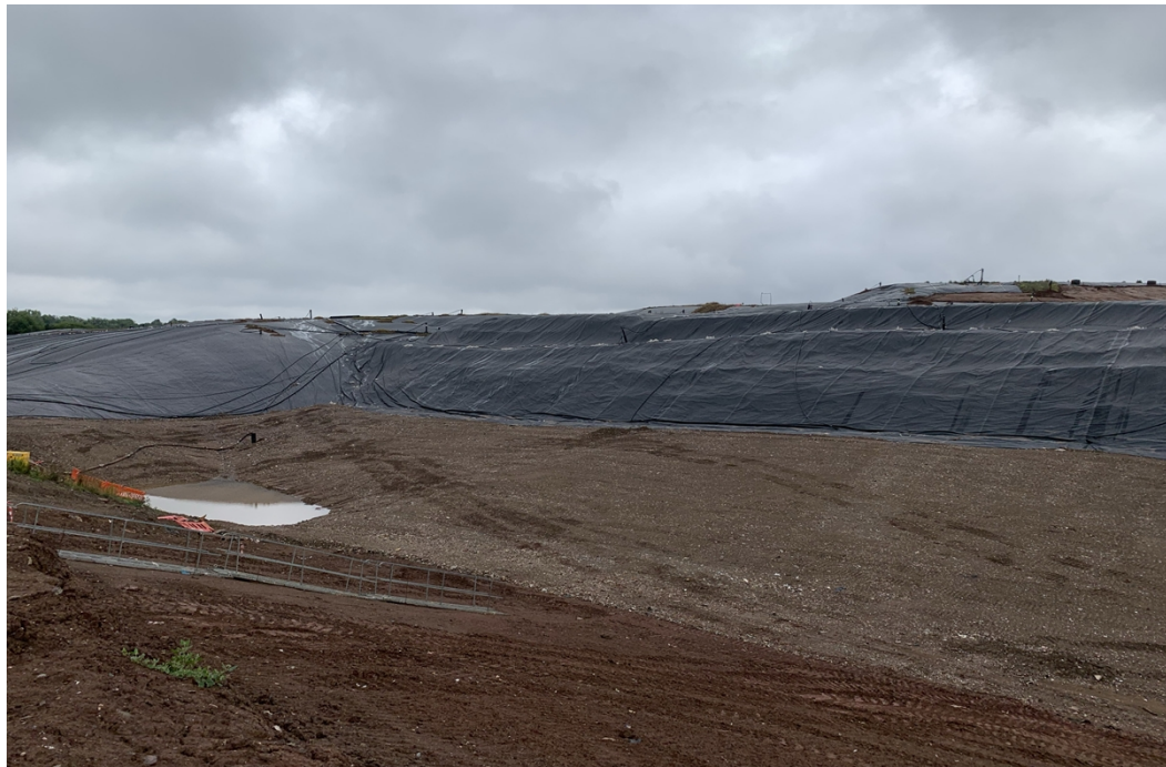
a. Photograph of imported material in the void area taken on 29 July 2025

localised off-site odour. We have instructed contractors to keep this to a minimum as much as possible.'